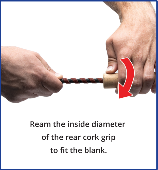
Ream the inside diameter of the rear cork grip to fit the blank.